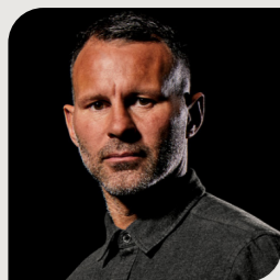
Ryan Giggs Trustee